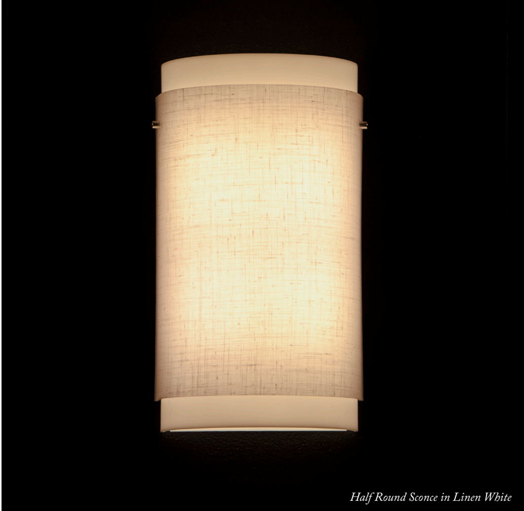
Half Round Sconce in Linen White