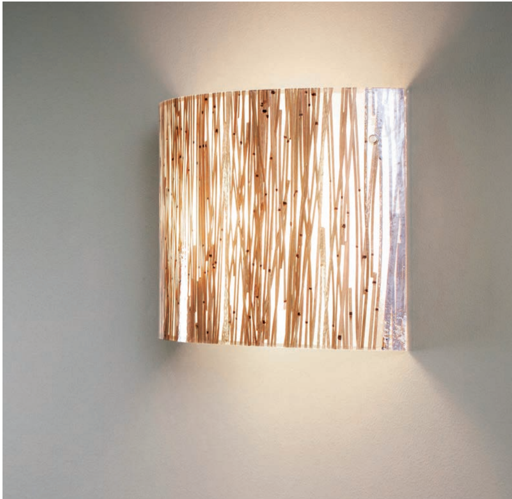
12" x 8" x 4" in 1/4" Thatch