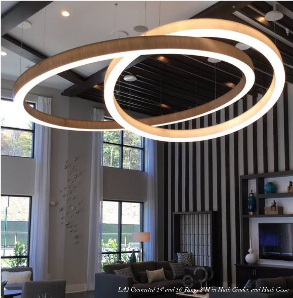
LA2 Connected 14' and 16' Rings 8"H in Hush Cinder, and Hush Gesso