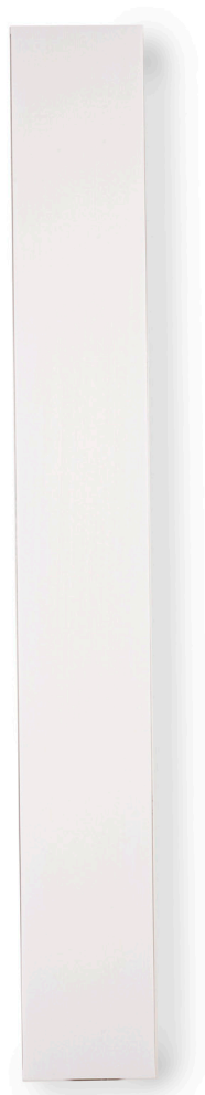
5" x 4" x 36" (Large) in Gesso