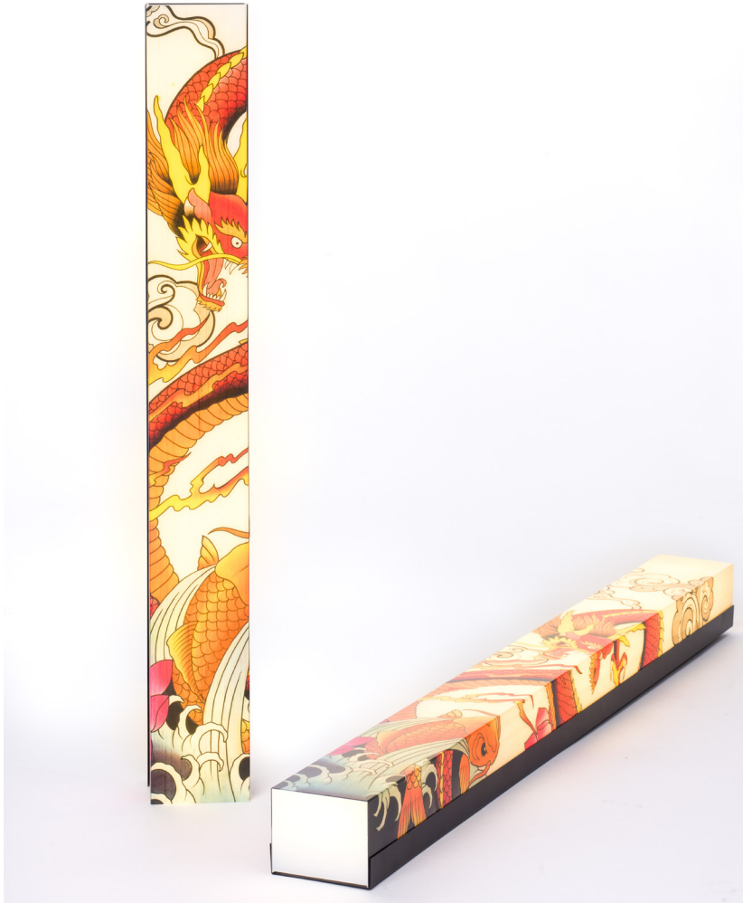
5" x 4" x 48" (Large) in a Highres Tattoo print