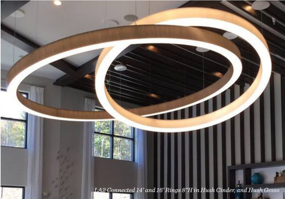
LA2 Connected 14' and 16' Rings 8"H in Hush Cinder, and Hush Gesso