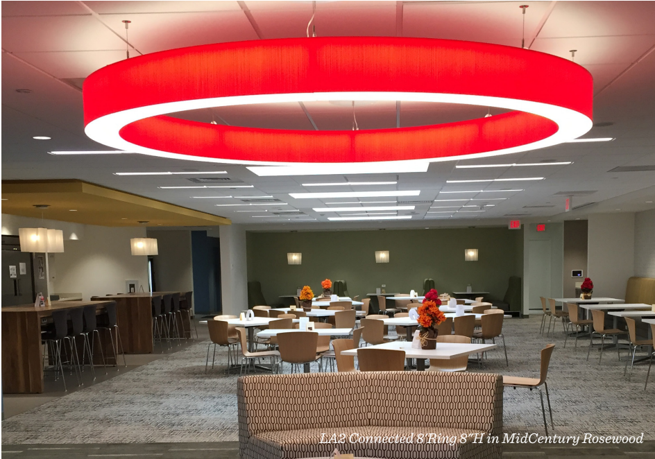
LA2 Connected 8' Ring 8"H in MidCentury Rosewood