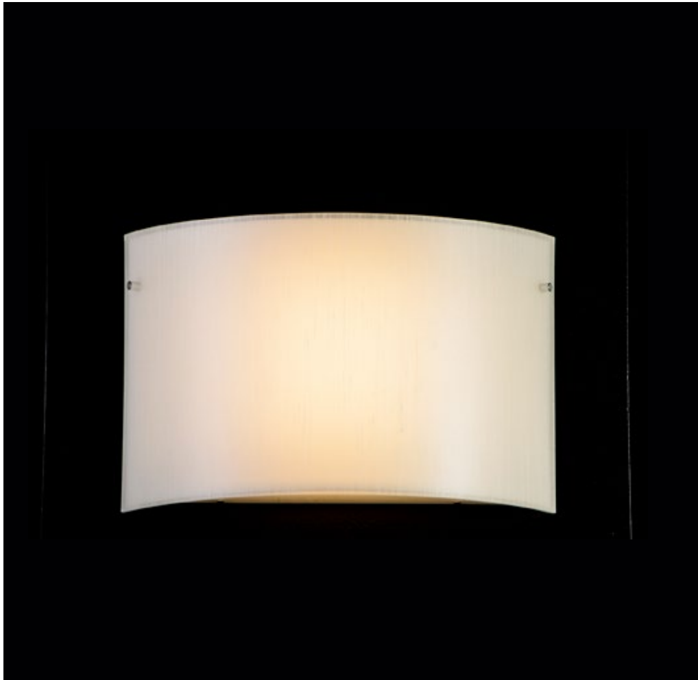
Eco Sconce in Linea Ivory